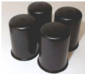
Protective caps for foundation bolts. The caps contain grease sealed inside.