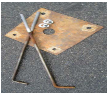
Foundation bolts with washers and nuts, incl. casting template

During casting, 4 foundation bolts are mounted on the casting template and lowered into the wet concrete. The casting template rests on the concrete surface until curing is complete.