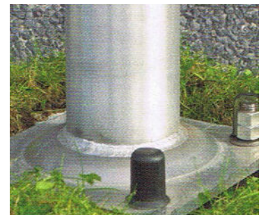
The seal is removed and the caps are pressed down over the bolts. Supplied in sets of 4 pcs.