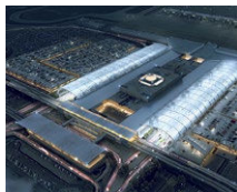
Atlanta Airport (US)