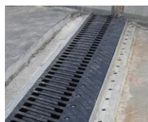
Sliding finger joints