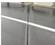
Single gap joints