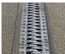
Cantilever finger joint