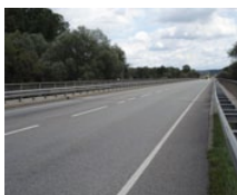
Inn Bridge Simbach (DE)