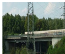
A8 Wendlingen (DE)