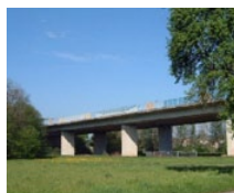
Ohrntal Bridge Öhringen (DE)