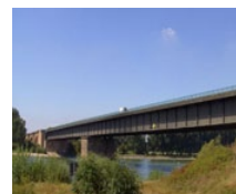
Rhine Bridge Frankenthal (DE)