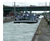
Hindenburg Bridge (DE)