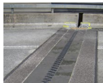
Brüttiseller Kreuz (CH)