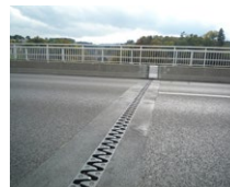
Fürstenland Viaduct (CH)