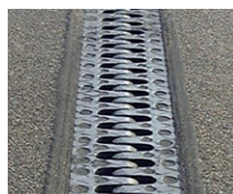
Cantilever finger joints