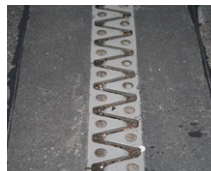
Hang Bridge (DE)