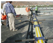
Fanja Bridge (Oman)