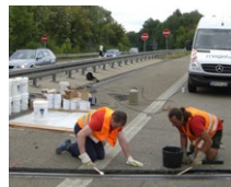
Kasseler Kreuz (DE)